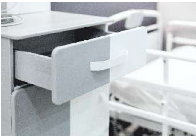
Boxes integrated with the unit