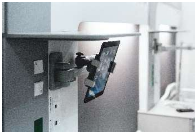
Shelves for medical instruments and holders for patient's mobile devices